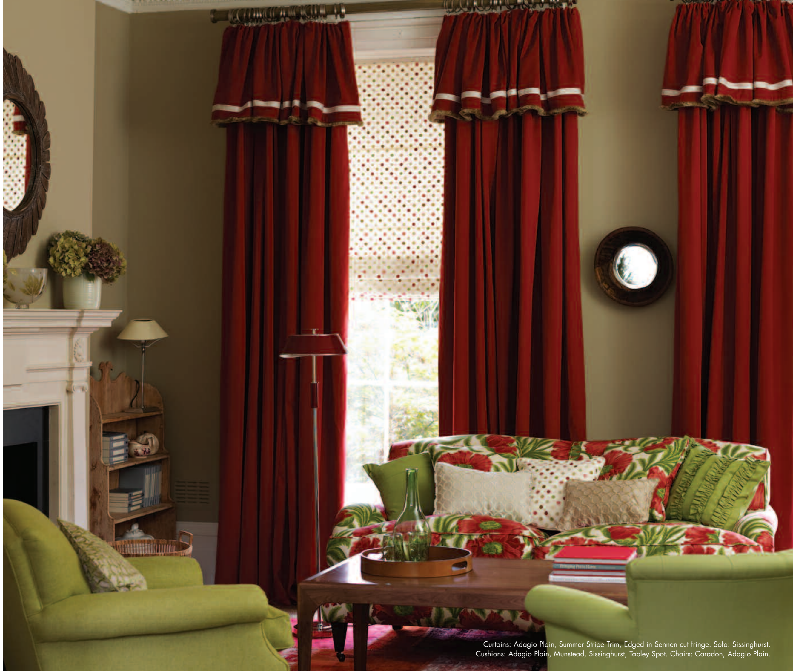
Curtains: Adagio Plain, Summer Stripe Trim, Edged in Sennen cut fringe. Sofa: Sissinghurst. Cushions: Adagio Plain, Munstead, Sissinghurst, Tabley Spot. Chairs: Caradon, Adagio Plain.