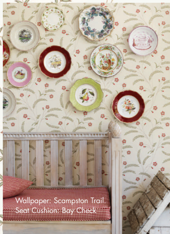
Wallpaper: Scampston Trail. Seat Cushion: Bay Check