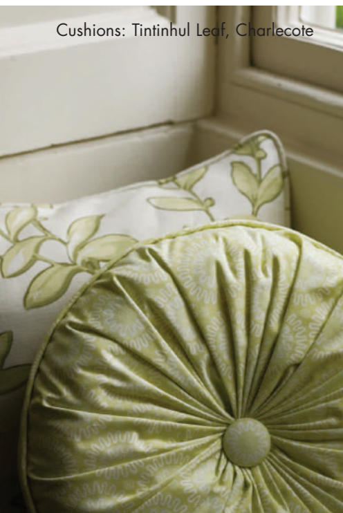
Cushions: Tintinhul Leaf, Charlecote