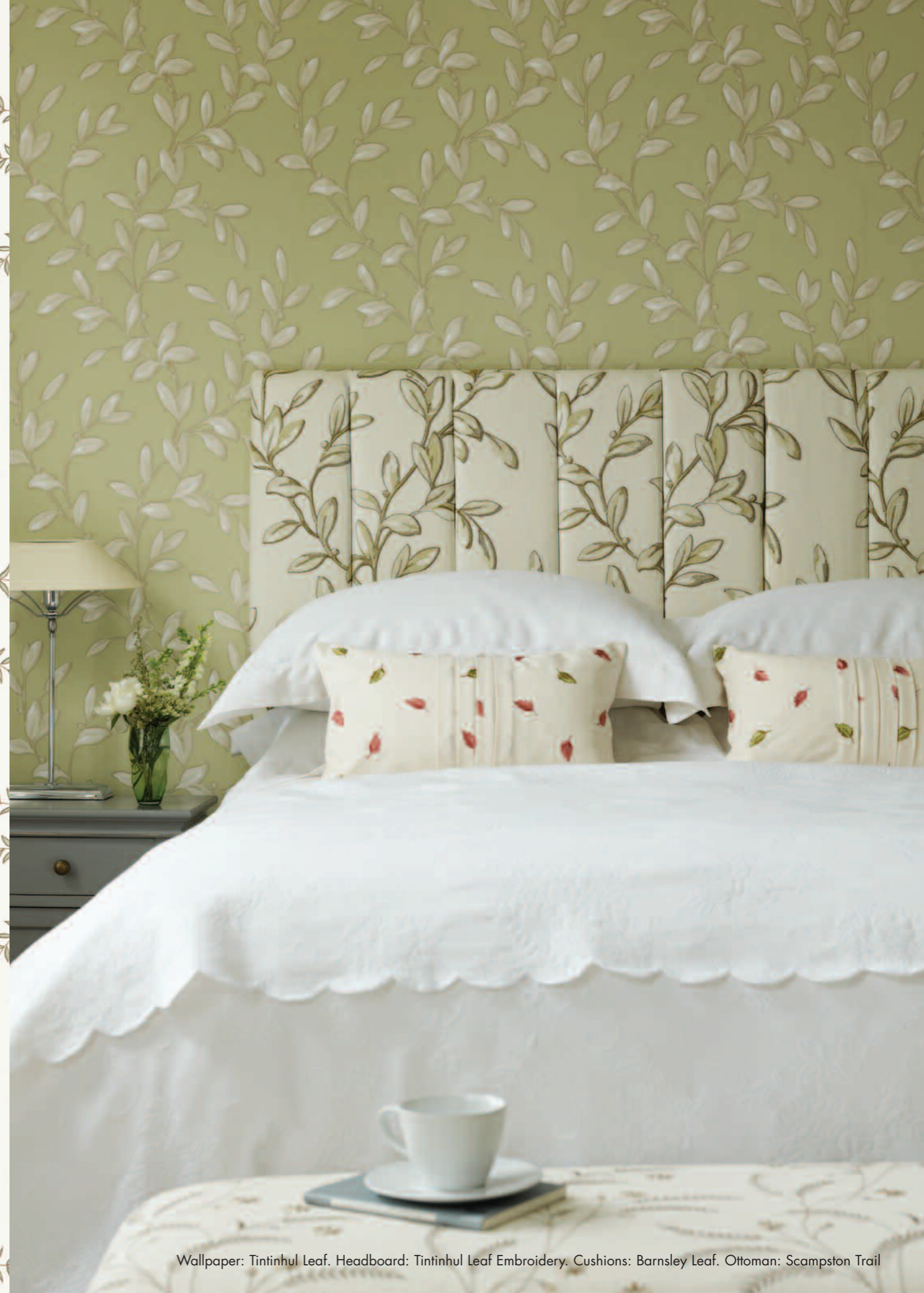
Wallpaper: Tintinhul Leaf. Headboard: Tintinhul Leaf Embroidery. Cushions: Barnsley Leaf. Ottoman: Scampston Trail