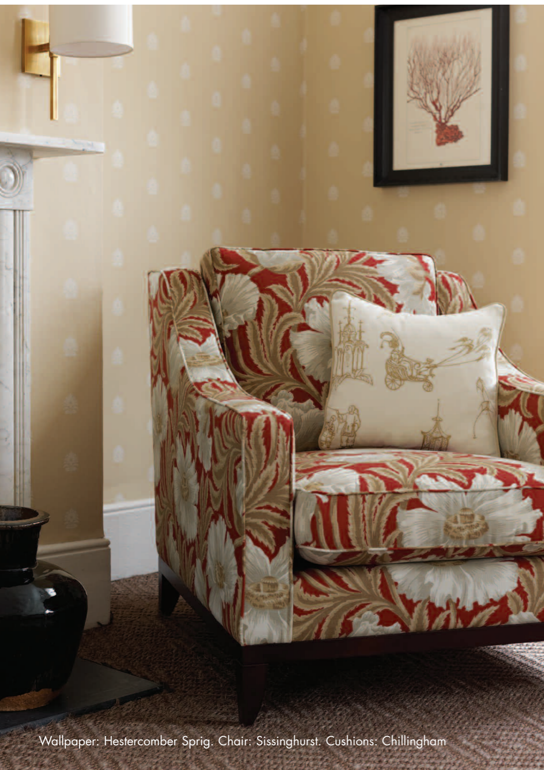
Wallpaper: Hestercomber Sprig. Chair: Sissinghurst. Cushions: Chillingham