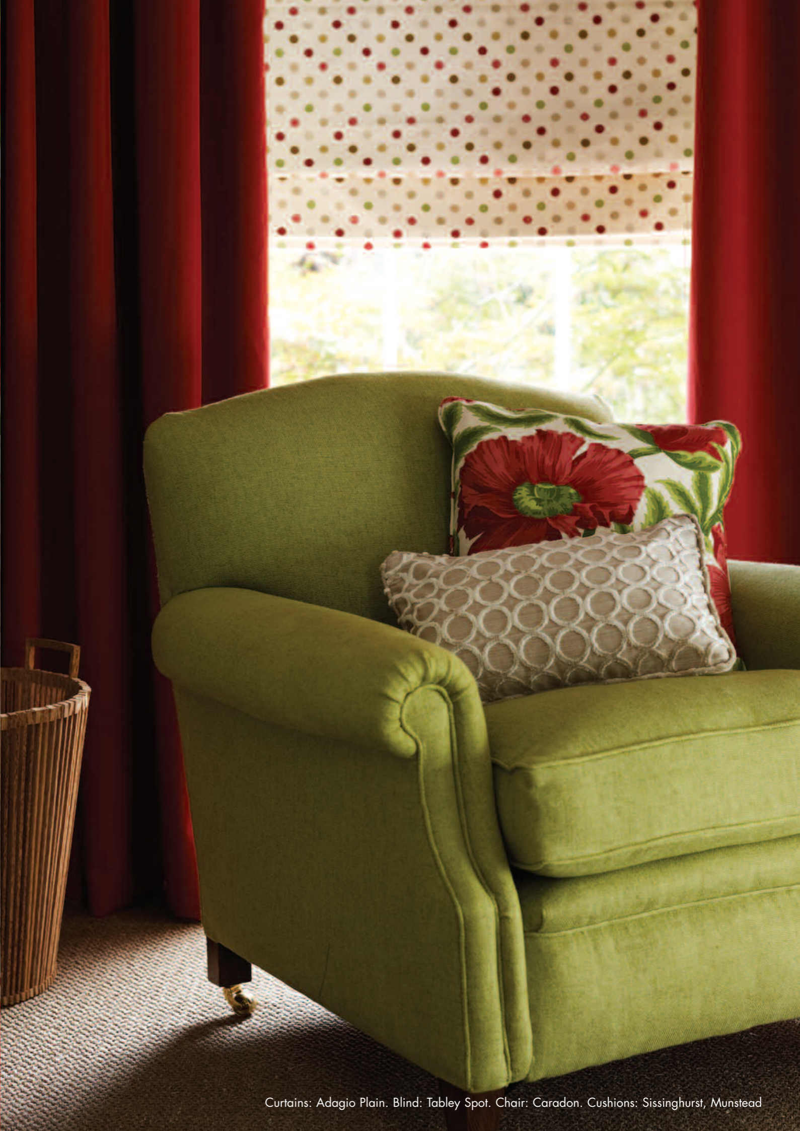
Curtains: Adagio Plain. Blind: Tabley Spot. Chair: Caradon. Cushions: Sissinghurst, Munstead