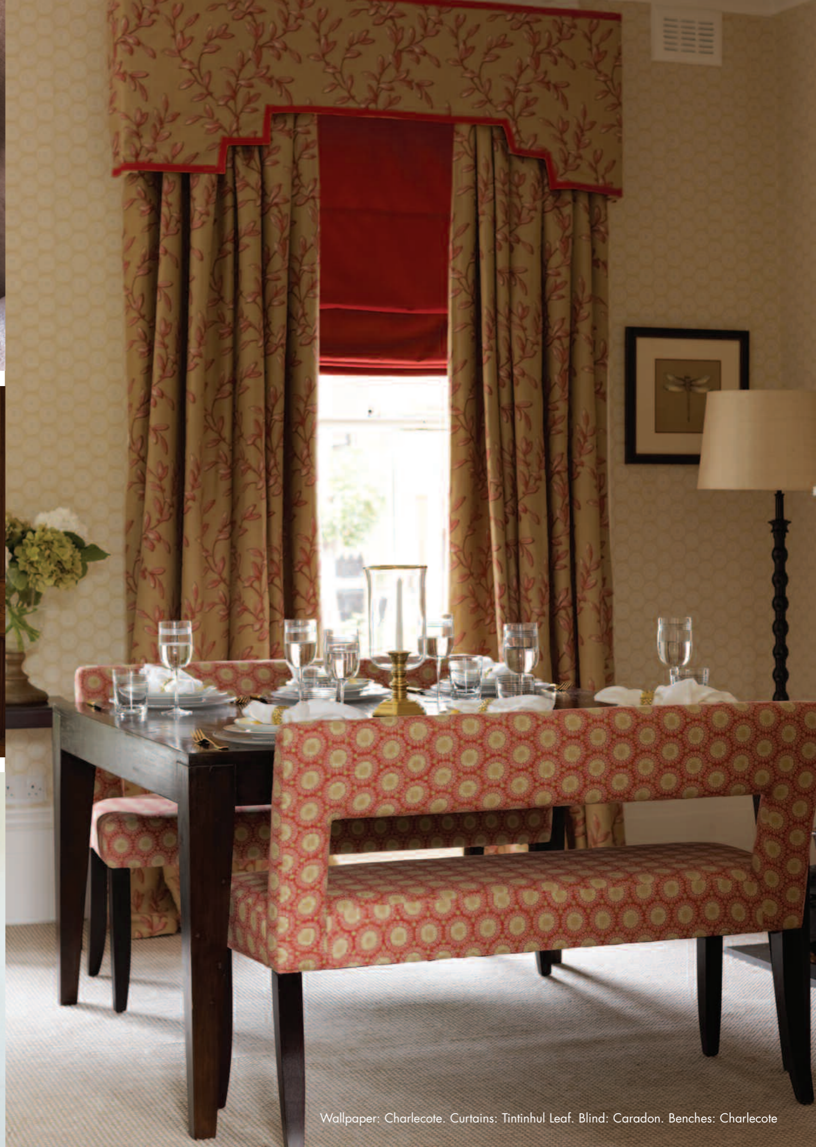
Wallpaper: Charlecote. Curtains: Tintinhul Leaf. Blind: Caradon. Benches: Charlecote