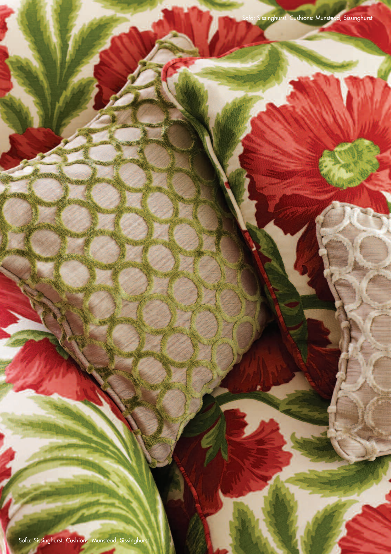
Sofa: Sissinghurst. Cushions: Munstead, Sissinghurst