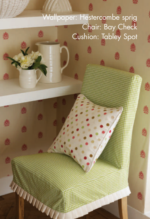
Wallpaper: Hestercombe sprig Chair: Bay Check Cushion: Tabley Spot