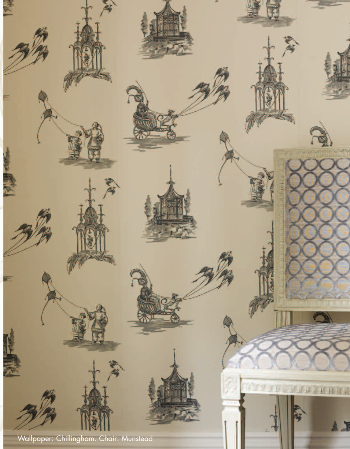
Wallpaper: Chillingham. Chair: Munstead