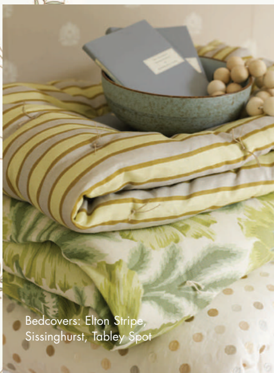
Bedcovers: Elton Stripe, Sissinghurst, Tabley Spot