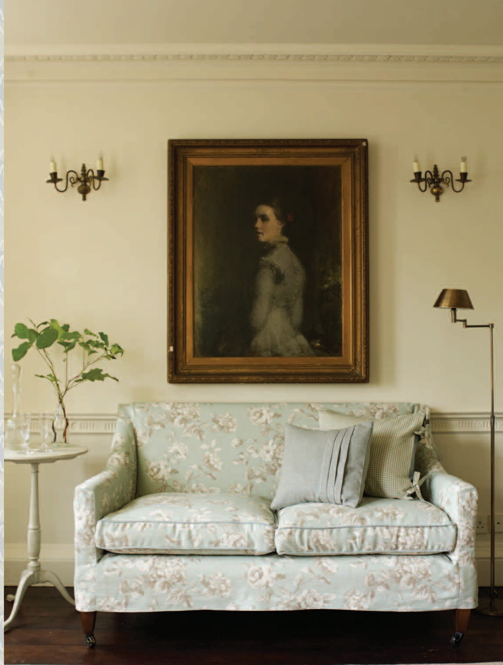
Sofa: Mottisfont. Cushions: Cardaon, Bay Check