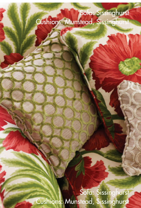
Sofa: Sissinghurst Cushions: Munstead, Sissinghurst