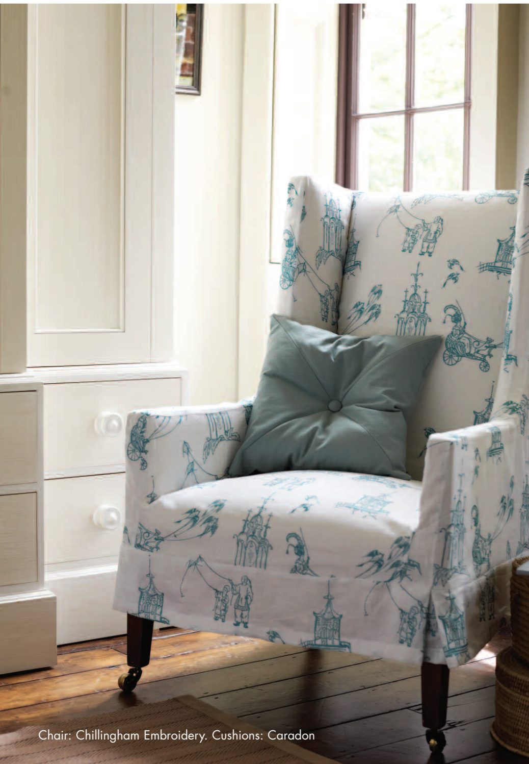
Chair: Chillingham Embroidery. Cushions: Caradon