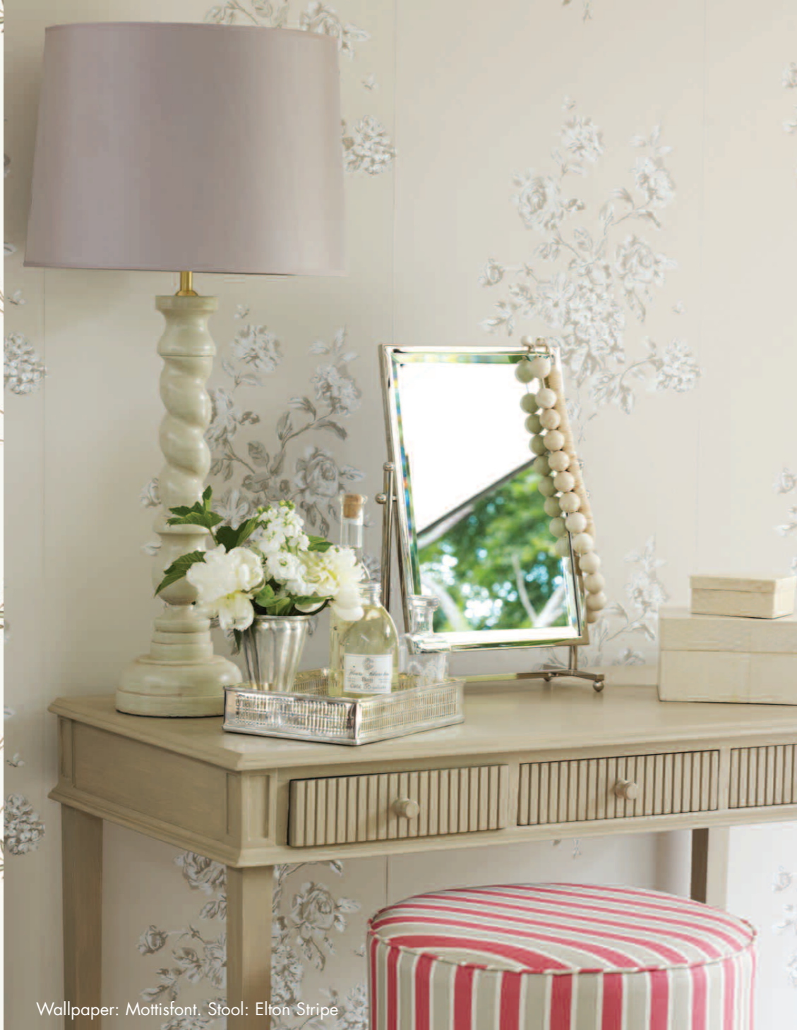
Wallpaper: Mottisfont. Stool: Elton Stripe