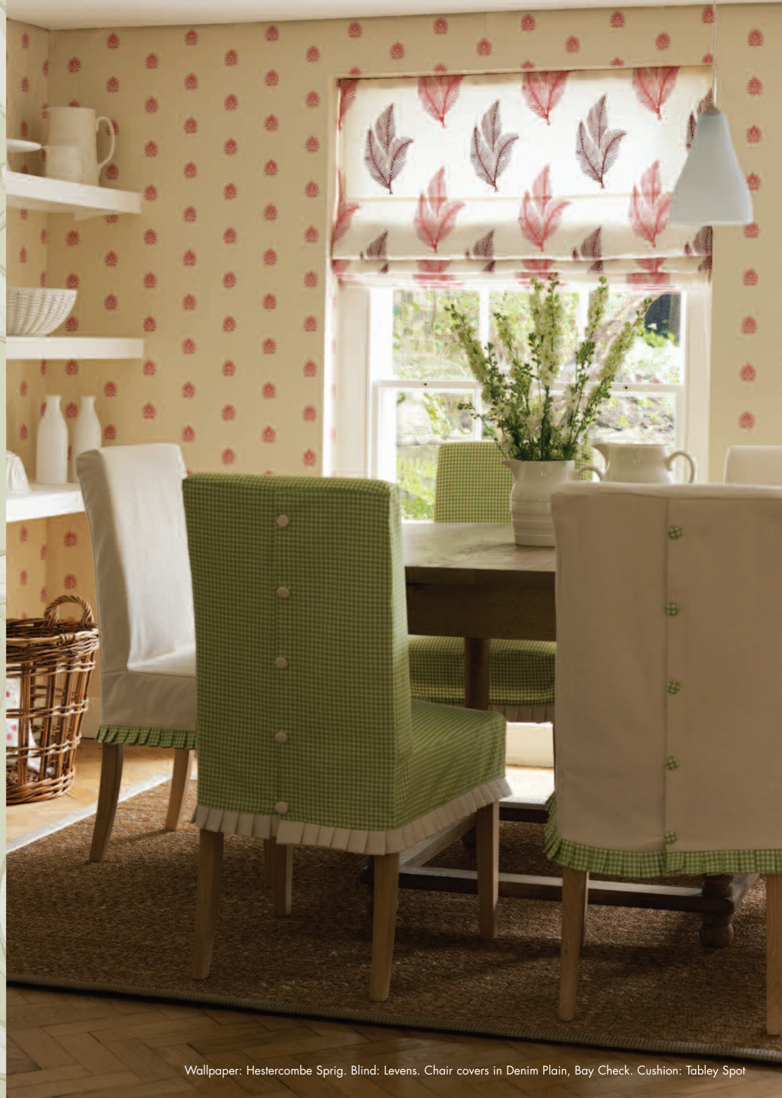
Wallpaper: Hestercombe Sprig. Blind: Levens. Chair covers in Denim Plain, Bay Check. Cushion: Tabley Spot