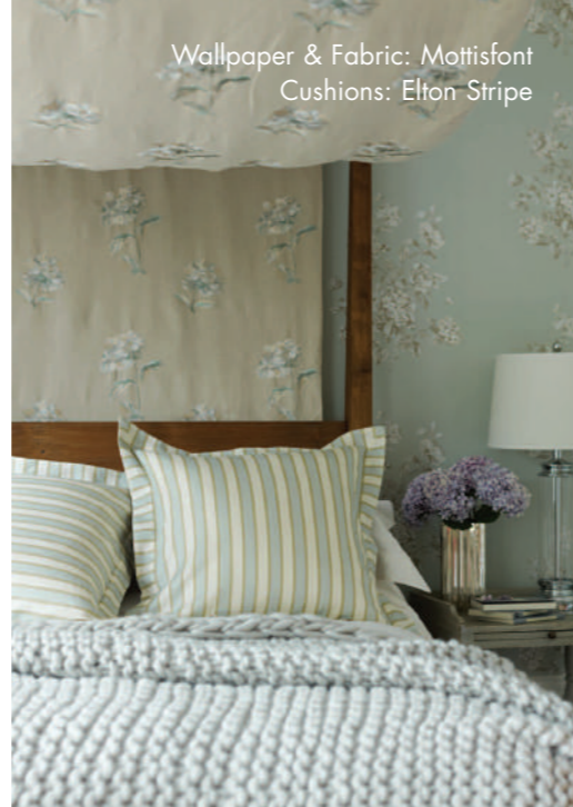
Wallpaper & Fabric: Mottisfont Cushions: Elton Stripe