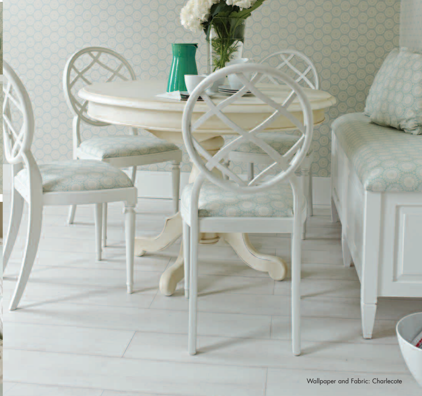
Wallpaper and Fabric: Charlecote