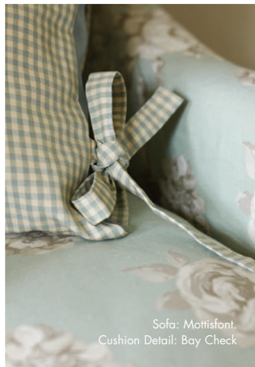
Sofa: Mottisfont. Cushion Detail: Bay Check