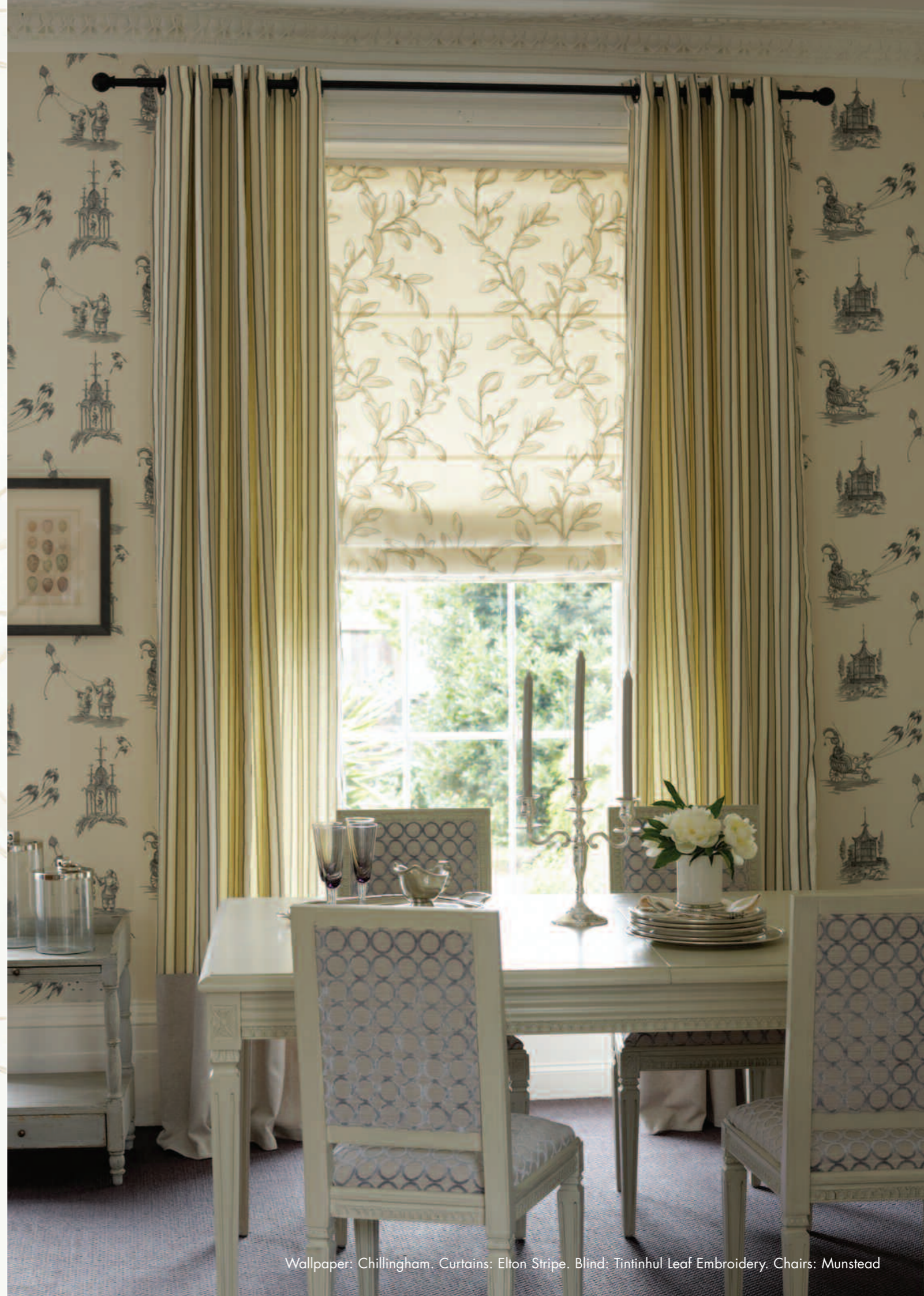
Wallpaper: Chillingham. Curtains: Elton Stripe. Blind: Tintinul Leaf Embroidery. Chairs: Munstead