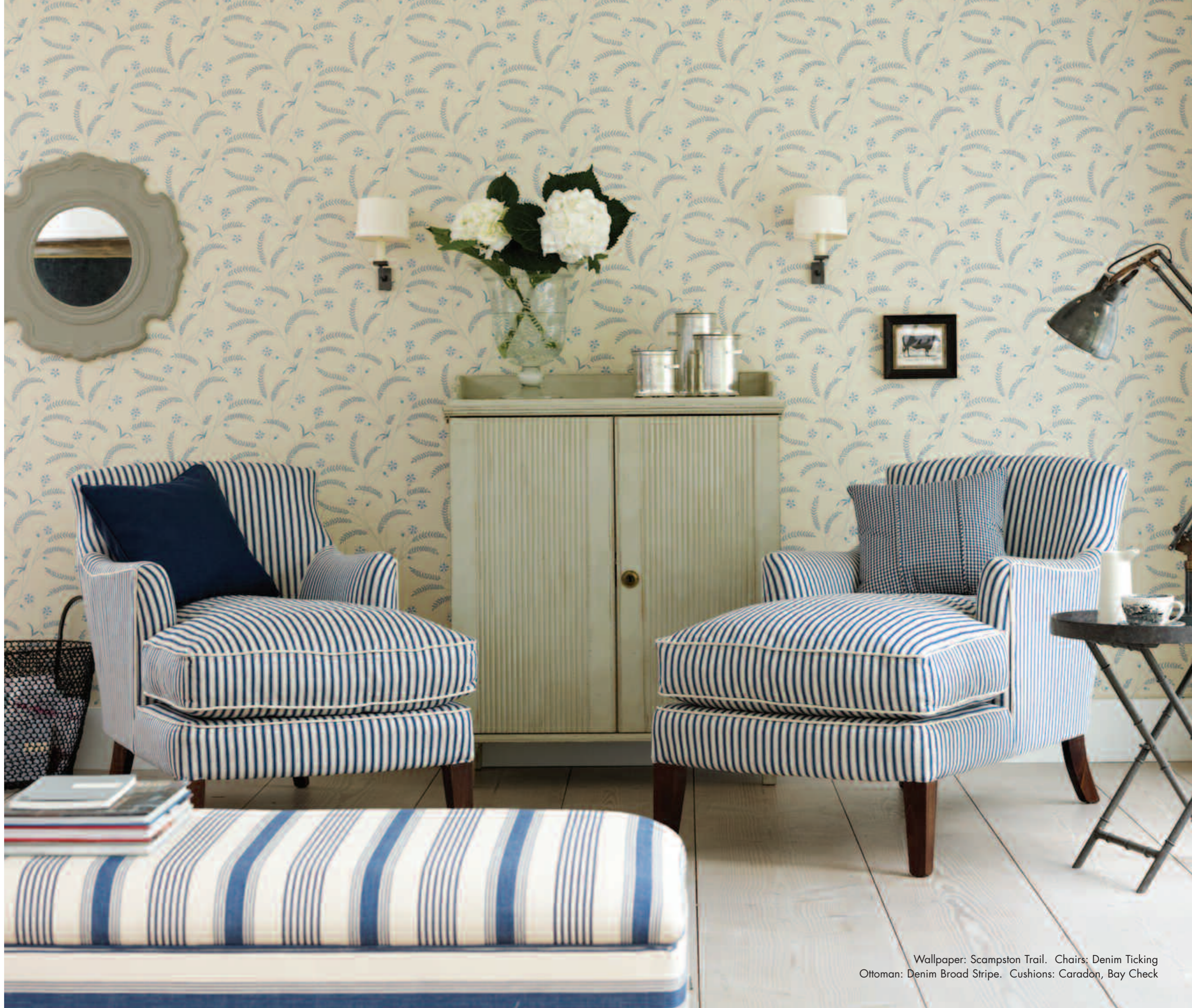
Wallpaper: Scampston Trail. Chairs: Denim Ticking Ottoman: Denim Broad Stripe. Cushions: Caradon, Bay Check