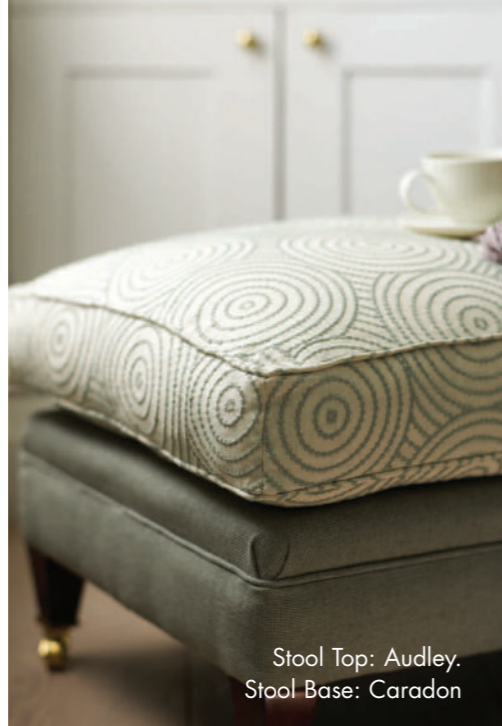
Stool Top: Audley. Stool Base: Caradon